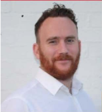
Mr. Ben Saunders Primary School