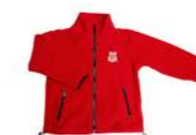
Red Fleece Jacket