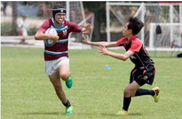
Rugby 12 teams U9 - U18