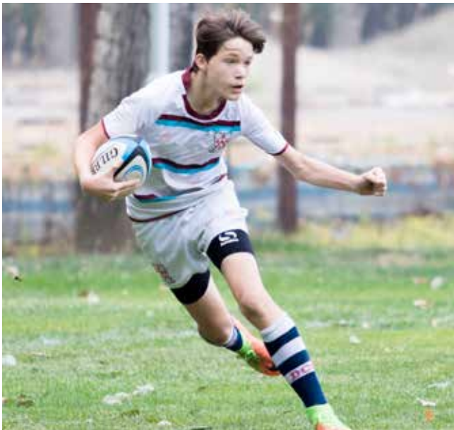
Touch Rugby 3 teams U12 - U14