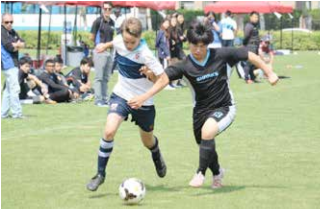
Football 40 teams U7 - U18

Within the above framework the College has over 100 active sports teams. The following is an outline of the competitive teams and squads.