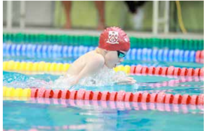
Swimming 12 squads from 8 and under to 15 and over