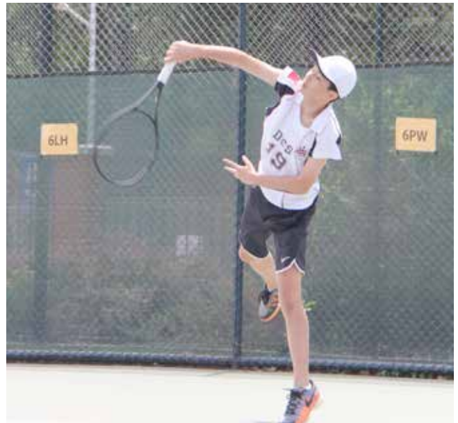
Tennis 3 teams U11 - U18