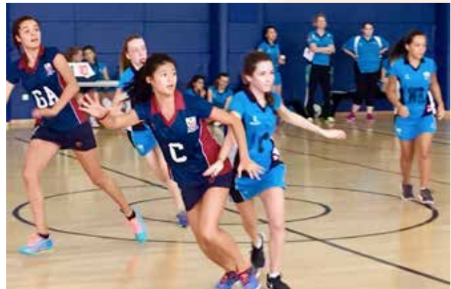
Netball 11 teams U9 - U18