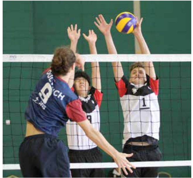
Volleyball 10 teams U14 - U18