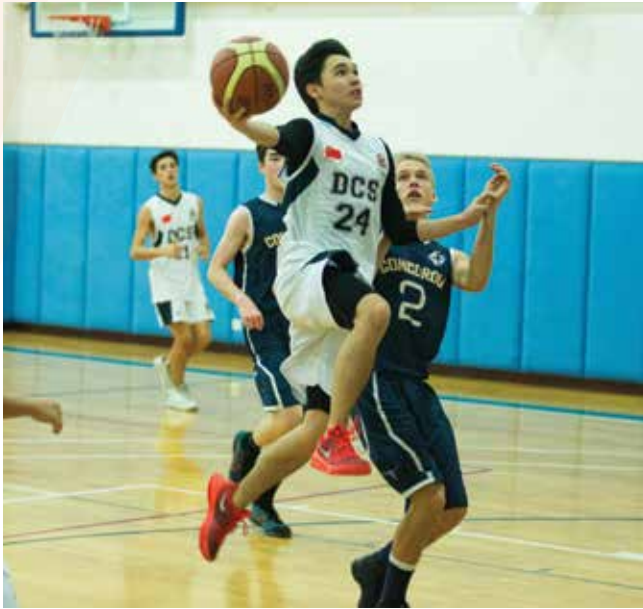
Basketball 13 teams U13 - U18