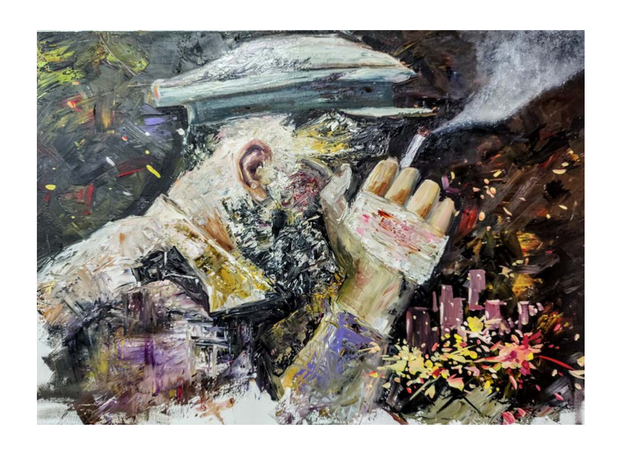
last cigarette 3 March 2020 Oil paint

I wanted to show the significance and courage of soldiers in the aftermath of war. The burn marks on the soldier's face is vividly depicted using multiple layers of paint. His apathy towards the current world is reinforced to the audience through the pitch-black background. However, the shrapnel shells are colorful and symbolise the creation of better lives for their next generation. The idea of keeping the soldier's face anonymous is to represent all the soldiers that sacrificed their lives.