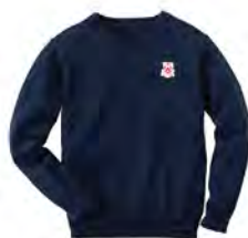
Merino wool or cotton sweater