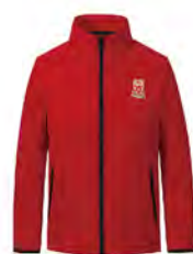
Polar fleece jacket