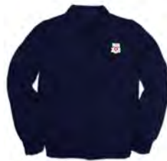
Merino wool or cotton cardigan