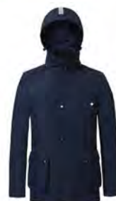
Winter parker jacket