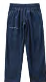
PE winter trousers (thick)