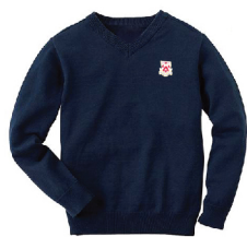
Merino wool or cotton sweater