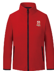
Polar fleece jacket