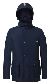
Winter parker jacket