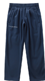
PE winter trousers (thick)